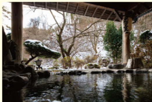
Kawanaka Onsen Kadohan Ryokan

This exclusive onsen only takes one group reservation at a time, but the quality hot spring waters and top-notch food is worth it. The 33-degree, fresh-from-the-source water keeps customers returning year after year. Since the facilities are completely private, you can enjoy the bath for an hour, two hours, or even longer without having to worry about other guests. The inn was made specially for onsen connoisseurs who want a pure and uninterrupted onsen experience. Also includes Japanese home-style cooking on par with the highest-quality ryokan.