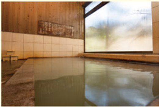
Hatonoyu Onsen Sankyuro

Established in the early Edo Period (1603~), Hato no Yu has been in the onsen business for hundreds of years. It features an iconic gabled roof from the late 1800's and cloudy hot spring waters that are good for the skin. There is an old legend that pigeons used the onsen water to heal their wounds, and anyone who has experienced this chloride-rich water is bound to nod along in agreement. Known as the “finishing water” to be used after a visit to Kusatsu Onsen, Sankyuro has historically been used as a medical retreat for those suffering from illness (a practice called “toji” in Japanese).