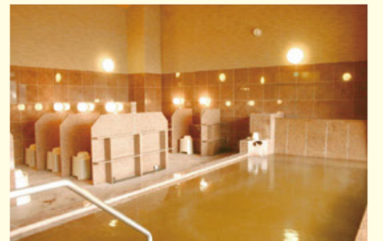
Agatsumakyo Onsen Tengu Hot Spring

“Straight from the source” is the motto here. Kikyokan is a pioneer on the day-spa scene in Japan. The chloride-rich waters are gentle on the skin and leave a light coating. The facilities boast a gorgeous view of Iwaido Cave and piping hot water at 51 degrees! Kikyokan was established in 1987 as a day-spa, and since then has maintained a strict “straight-from-the-source” policy. Special events are held at the spa, including a karaoke tournament. Piping hot water and energetic karaoke make this a truly unique day-trip onsen of the Showa era.