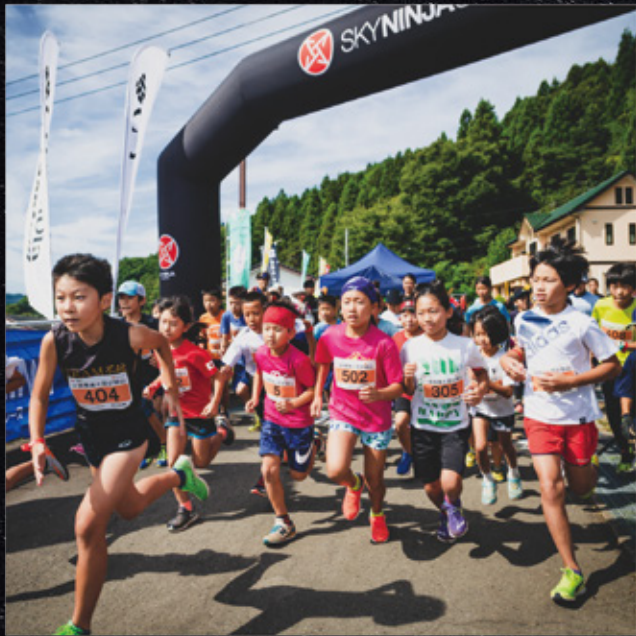
Iwabitsu Shinobi Trekking