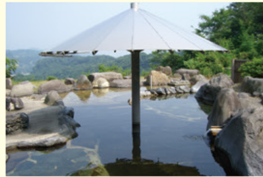
Agatsuma Onsen Negoya no Yu

A nostalgic getaway at the foot of Asama Kakushi-yama. Look out upon to the traditional “nagayamon” gates, thatch-roofed buildings brought from all over Japan., and over 4,500 pieces of antique folk art. The massive facilities stretch over 20,000 square meters with over 20,000 railroad ties running through them. The waters of Yakushi, however, are the most alluring feature. The facilities use fresh onsen water drawn straight from the source, and Takimi-no-yu, the open-air bath that looks out upon the valley, is sure to heal both mind and body.