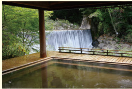
Yakushi Onsen Hatago

Established in the early Edo Period (1603~), Hato no Yu has been in the onsen business for hundreds of years. It features an iconic gabled roof from the late 1800's and cloudy hot spring waters that are good for the skin. There is an old legend that pigeons used the onsen water to heal their wounds, and anyone who has experienced this chloride-rich water is bound to nod along in agreement. Known as the “finishing water” to be used after a visit to Kusatsu Onsen, Sankyuro has historically been used as a medical retreat for those suffering from illness (a practice called “toji” in Japanese).