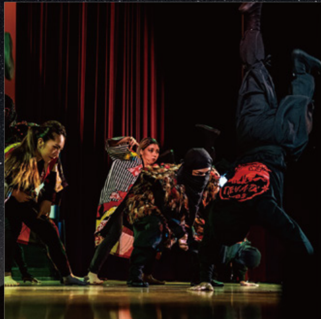
A Town with History A Town of Excitement