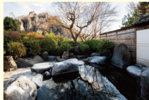
Azuma Onsen Kikyokan

Kawanaka Onsen is known as one of the 3 famous “onsen for beauties” in Japan, and Kadohan Ryokan is highly recommended by the Japan Association of Secluded Hot Spring Inns. Secluded in the lucious green of the mountains, the onsen waters here are a comfortable temperature perfect for a long soak. The gentle water is perfect for those who want soft, beautiful skin. Of course, the hot springs are also perfect for relaxation and stress relief.