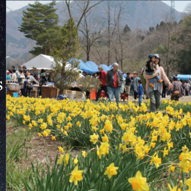
Higashi-Agatsuma Daffodil Festival