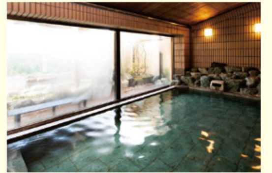
Forest Resort Conifer Iwabitsu

Located on the cliff created by the Agatsuma and Numao Rivers, the day-spa Negoya no Yu offers breathtaking views. The view from the cliffside open-air bath is superb, showing the Agatsuma river in the foreground, Mt. Akagi in the distance, and a clear blue sky overhead. The onsen is only open on Saturdays, but you'll be dazzled by the starry night sky and natural scenery seen from the open-air bath.